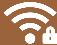
Secure wireless configuration