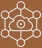
Powerful IoT-ready device

The RTMS technology provides meaningful and reliable data that maximizes the full potential of existing infrastructure and optimizes the safety and efficiency of every city.