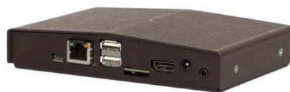
Wrong Way processor