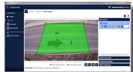
Easy visual zone setup

The wrong way module is easy to set up, install and configure using the Supervisor software.