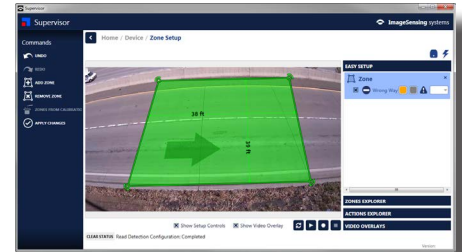
Easy visual zone setup

The wrong way module is easy to setup, install and configure using the Supervisor software.