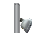
RTMS Sx-300 HDCAM

Wrong Way processor inside the cabinet communicates back to the traffic management center