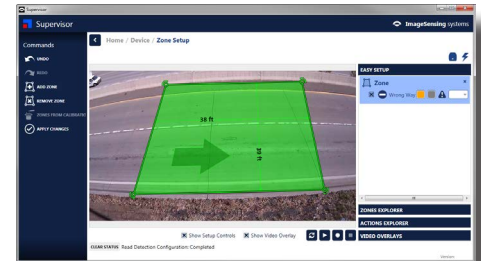
Easy visual zone setup

The wrong way module is easy to setup, install and configure using the Supervisor software.